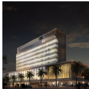
San Bernardino Justice Center

Skidmore, Owings & Merrill LLP is one of the leading architecture, interior design, engineering, and urban planning firms in the world, with a 78-year reputation for design excellence and a portfolio that includes some of the greatest architectural accomplishments of the 20th and 21st centuries. SOM has a proven track record of successfully completing design services on a multitude of development projects across the world.