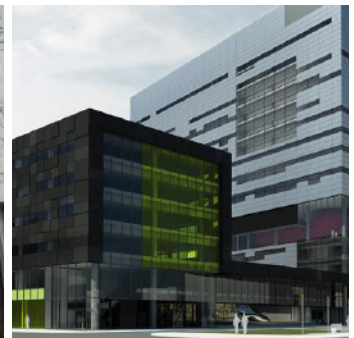
University of Montreal Medical Research Centre