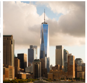
One World Trade Center