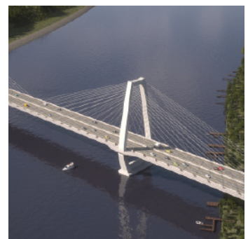
Ohio River Bridges East End Crossing Project

Walsh Investors, L.L.C. is an investor/developer of P3 projects across North America. It is an affiliate of The Walsh Group, one of the largest contractors operating in the State of Indiana (whose subsidiary, Walsh Construction, is the lead contractor for the Marion County Justice Center). Walsh has developed or invested in numerous industrial commercial, residential and transportation projects including two of the largest P3 availability payment projects in the United States - the Ohio River Bridges East End Crossing Project in Indiana/Kentucky and the Rapid Bridge Replacement Project in Pennsylvania.