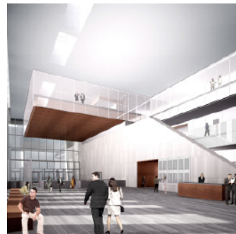
San Diego Superior Courthouse